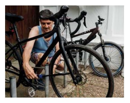
One of the Nehemiah Residents preparing for a bike ride.

The Nehemiah Project provides a home and support for men with a history of addiction. Our residential programme is abstinence-based where men can address the root causes of their addiction within a supportive environment.